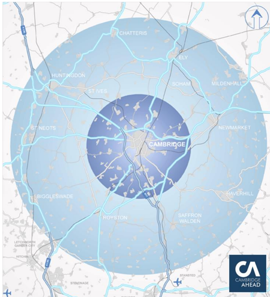
Figure 1 Cambridge city region (previously known as Cambridge Ahead area)

The Cambridge based companies were then selected as companies with either their registered office, or their primary trading address, in one of the Cambridge city region postcodes. The location of each company for mapping purposes was taken to be the postcode of its primary trading address. In many cases the primary trading address was not provided. In general, the registered office address was then used as the location postcode. However, in many cases local knowledge and internet searches enabled us to identify a primary trading address despite it not being found on FAME. The whole of a company's operations is displayed at its primary trading address even if it operates at several locations in the Cambridge area. The database has over 26,000 Cambridge based companies in the Cambridge city region alive in 2021/22.